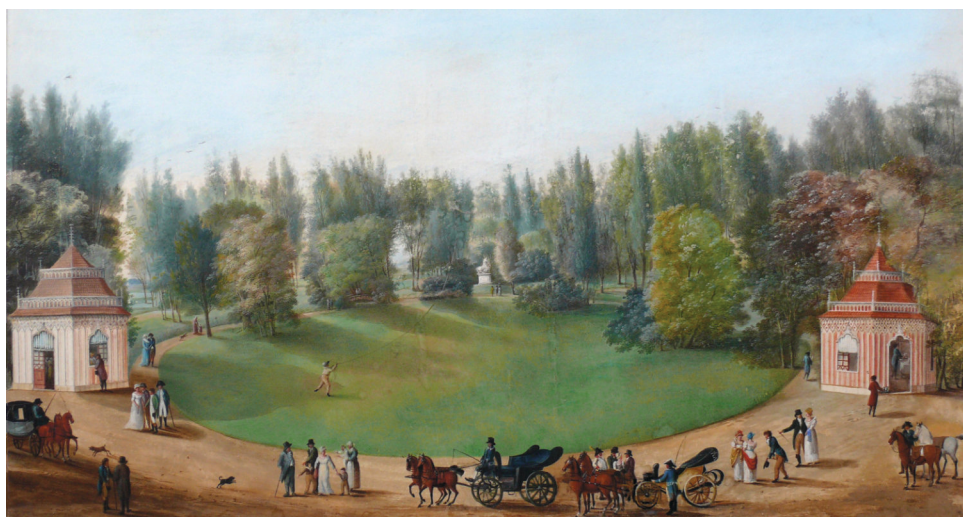
3 | Hédervár Park, seen from the house. Gouache by unknown artist, circa 1815 (from Gábor Alföldy's collection).

Grund«. Indeed, Petri's garden descriptions influenced the readers' perception and appreciation not only of the English (landscape) garden but sensitised them towards the appreciation of the picturesque beauty of rural and natural sceneries as well. 31