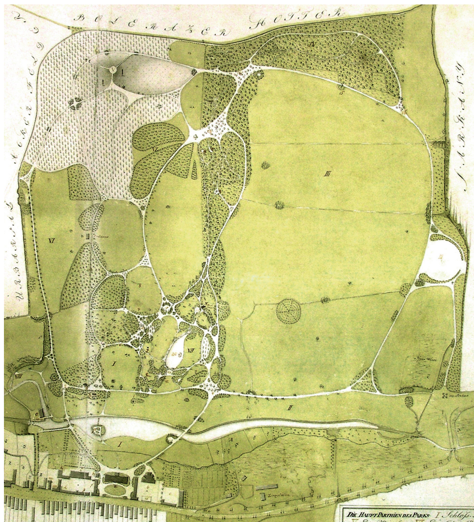
12 | Plan of Alsókorompa showing the embellishment work of Heinrich Nebbien. Ink and watercolour on paper, Eugen Jeroszlawsky, 1822 (Slovak National Museum, Music Museum Dolná Krupá).

overlooks the water at one end of the lake and there is an island at the other widening end with the family cemetery – »the island of the dead«. A carefully constructed system of clearings between clumps of trees and patches of woodland make the whole a grand composition. The large-scale park evoked an idyllic Arcadian landscape that produced profit in many ways. 84 The rest of the vast estate was handled purely as an industrialized agricultural landscape, which is today the most fertile in our country.