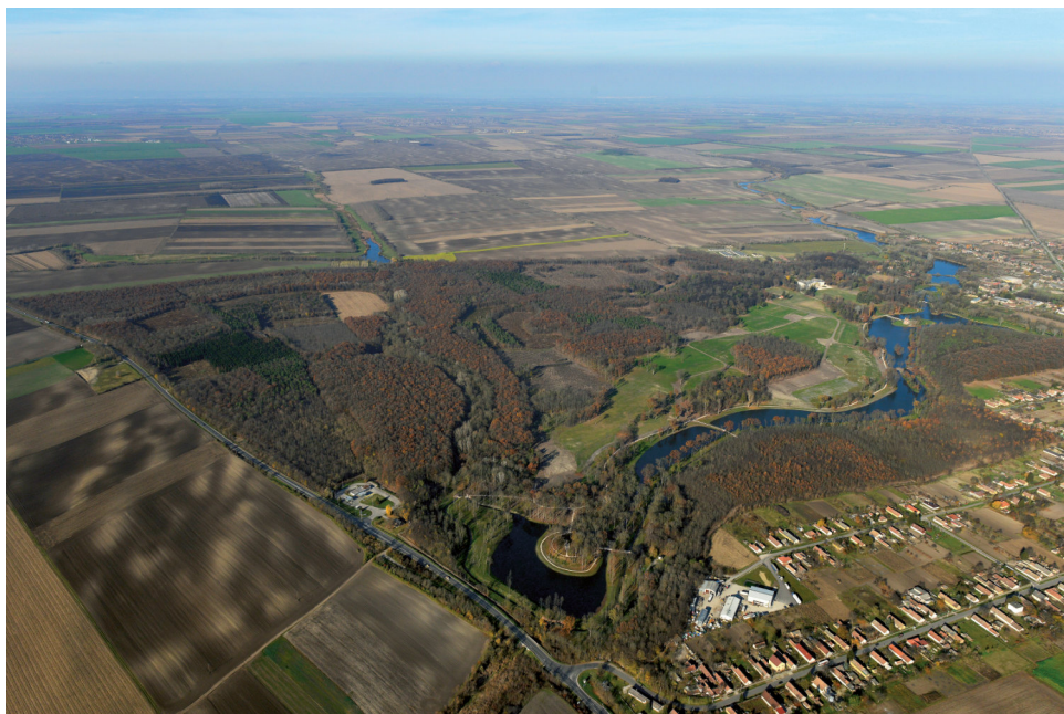
13 | Dég. The park of 300-hectares from the air after the restoration of the 2-km-long serpentine lake in 2015.

with straight roads, but – as in the case of Dég or Doba 85 – they often made use of existing characteristic landmarks of the landscape: mansions, churches, castle ruins as eye-catchers. Nevertheless, the developments and landscape embellishment efforts of Palatine Joseph and Antal Festetics prompted a contemporary journalist to formulate the following utopian idea: