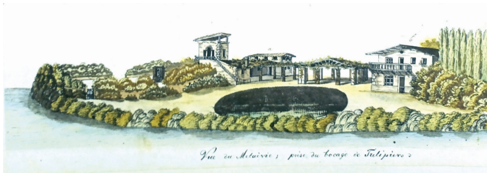
10 | Ensemble of farm buildings (Meierei) on the island of the lake in the Városliget/City Park of Pest, from Nebbien's entry for the design competition (published in: Nebbien, Heinrich: Ungarns Volks-Garten der Koeniglichen Frey-Stadt Pesth (1816). Manuscript, Budapest History Museum Kiscell Museum, Plan Collection, inv. no. 66.165).