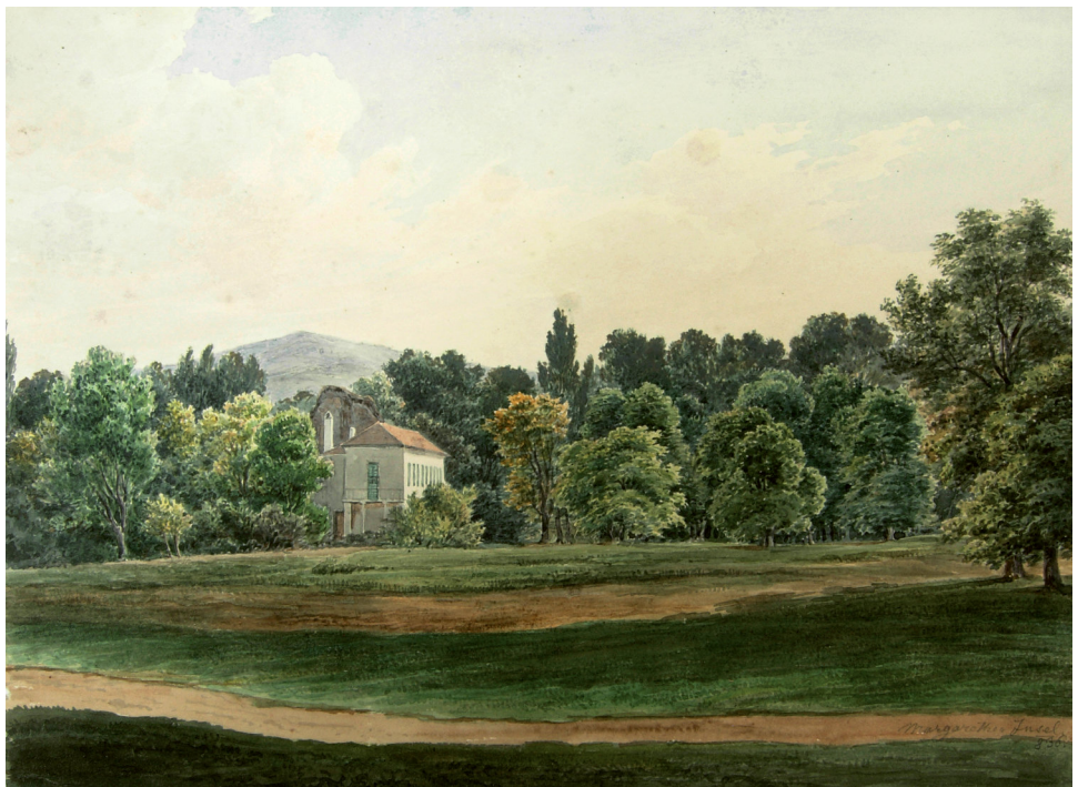
9 | Detail of Margaret Island with arable fields and the Palatine's villa attached to a mediaeval ruin. Watercolour on paper, Károly (Karl) Klette, 1824 (Hungarian National Museum, National Picture Gallery, inv. no. T.9300).