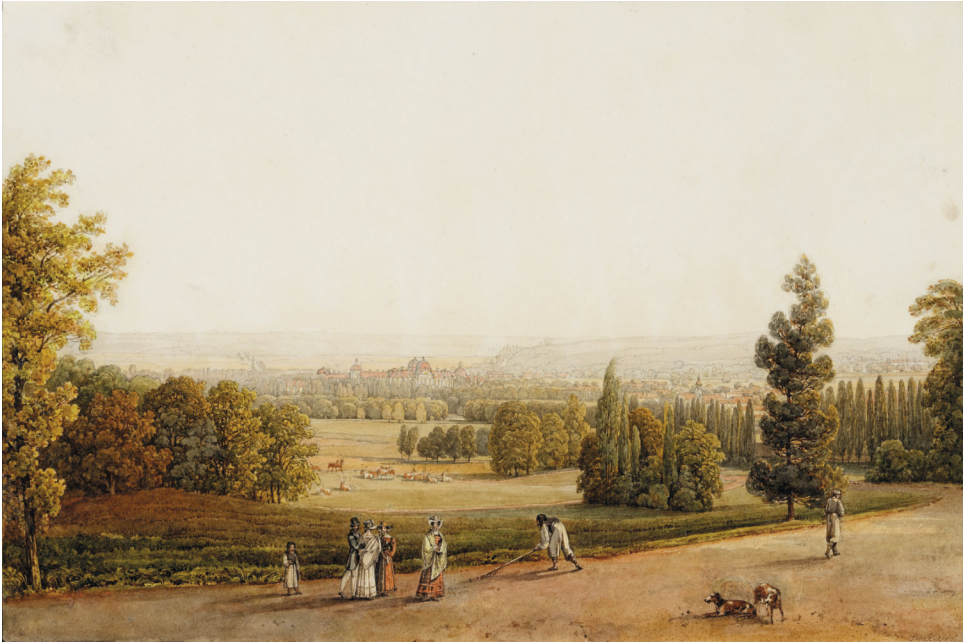
5 | Gödöllő, the embellished landscape with the mansion in the background. Watercolour, Thomas Ender, 1824–25 (Museum of Fine Arts, Budapest, Graphic Collection, inv. no. K.2002.1).

lake, motifs used by Robert in Méréville. This peripteros, housing the young princess's Carrara marble sitting statue by Antonio Canova (1757–1822), became the central feature of the landscape garden around the palace.