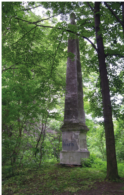
2 | The obelisk in Vedrőd (today Voderady, Slovakia) from 1794. Today the marble tablet commemorating Bernhard Petri's work is missing (Photography: Gábor Alföldy, 2003).