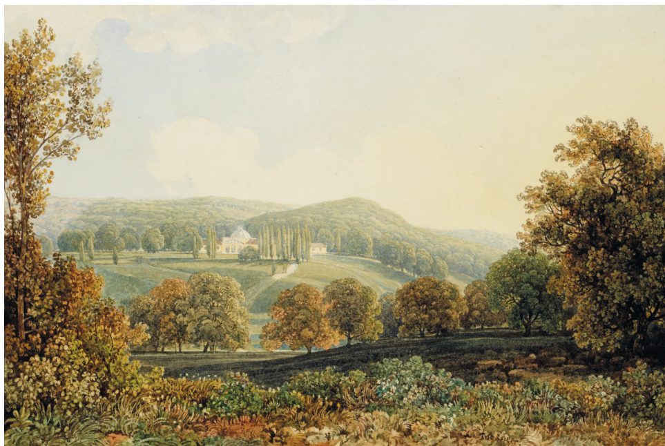
6 | Landscape with the farm house of Babat (the so-called the »Stable Mansion«) belonging to the Gödöllő Palace. Watercolour, Thomas Ender, 1824–25 (Museum of Fine Arts, Budapest, Graphic Collection, inv. no. K.2002.3).

of the estate including meadows, fields, forests and paddocks formed a grandiose composition. The large-scale landscaping of the Gödöllő estate, a masterpiece by an unknown designer, was achieved with extremely simple means, by integrating existing natural and rural beauty as well as built elements. The clumps and patches of woodland followed each other like »coulisses«, as this effect can be studied on contemporary watercolours (e.g. Fig. 5 and 6) by Thomas Ender (1793–1875).