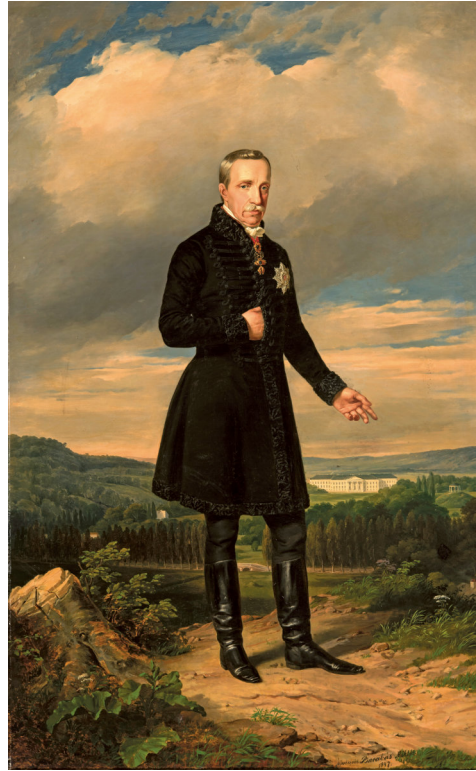
7 | Posthumous portrait of Archduke Joseph, Palatine of Hungary with his mansion, park and embellished estate of Alcsút in the background. Oil on canvas, Miklós Barabás, 1847 (Museum of Fine Arts/Hungarian National Gallery, Collection of Paintings, inv. no. 2022.9T).

More than a century after the Turkish occupation a major part of Hungary was still bare, even quicksand covered large areas. 72 The Hungarian Parliament passed a law in 1807 to bind quicksand by reforestation. Palatine Joseph was keen to create and save parks and gardens in Pest and Buda, and to fix quicksand and other barren areas throughout the country. Indeed,