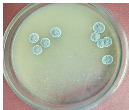
Figure 1. Colonies of S. hygroscopicus DA15 on solid medium after 4 days of cultivation

S. hygroscopicus was cultured on oat jelly. Results of morphological studies show that: Colonies of S. hygroscopicus DA15 are grayish brown, rounded,