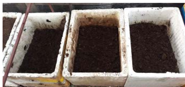
Figure 2. The organic cassava humus in experiments

raising earthworms. An amount of 100g - 200g of earthworms could use 300 kg of organic trash with treatment efficiency of 100%. (Hoang Anh Vu et al., 2017; Do Ngoc Bien, 2012; Dang Vu Binh, 2008).