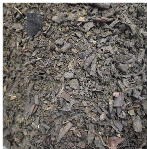
Figure 1. Cassava waste collected from Yen Binh Cassava Factory, Yen Bai province, Vietnam

The cassava residue including cassava peel, cassava pieces and soil discharged during the process of producing starch in Yen Binh Cassava Factory, Yen Bai province (figure 1). The mixture of cassava waste was crushed with a humidity range of 40-50%. Samples were analyzed for determining composition of some organic compounds and microorganisms.