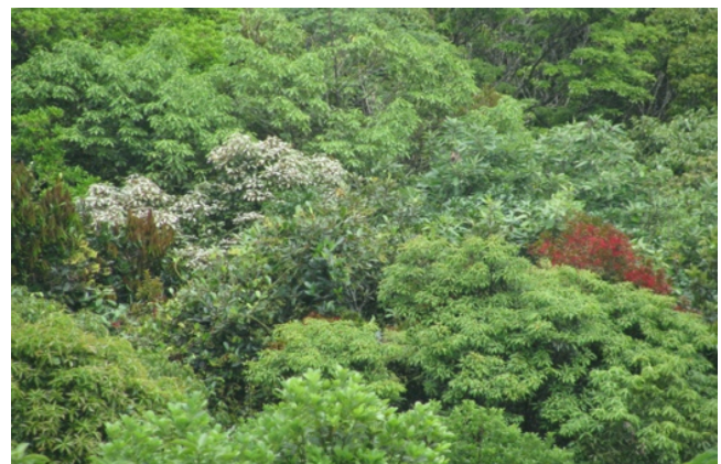
Figure 2. Vascular plants distribution type 1 (bellow 900m).

Type 1: Rain-loving tropical evergreen forest of the low belt below 900m (Figure 2). This type includes 4 types of richness forest, medium forest, poor forest, and restored young forest with 4 main communities. (1) tropical evergreen forests prefer rain with broadleaf trees that are less affected, dominant species such as Parashorea stellata , Scaphium macropodium , Pometia pinnata ; (2) tropical evergreen forest prefers broad-leaved and secondary trees that are strongly affected, with dominant species such as Ormosia dasycarpa , Macaranga denticulate , Cratoxylon formosum ; (3) secondary scrub, evergreen broadleaf, dominant species such as Rhodomyrtus tomentosa , Cratoxylon formosum , Mallotus paniculatus ; and (4) secondary tropical grassland, dominant species such as Saccharum spontaneum , Imperata cylindrical .