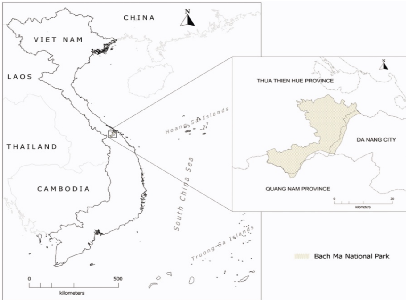
Figure 1. Location of Bach Ma National Park, Thua Thien Hue Province, Vietnam

The annual rainfall is about 8,000mm/year at the Bach Ma summit area. The rain starts from September to December accounting for over 70% of the total annual rainfall. The park has a watershed function of water conditioning for the major rivers in the region such as the Truoi river, Cu De river, and Ta Trach river (upstream of the Perfume river). With such complex topography, it is not surprising that this area is home to 1,715 species of fauna (7% of the total number of species in the country) and 2,373 species of flora and mushrooms, which accounts for nearly 17% of the total number of flora species in the country (BMNP, 2020).