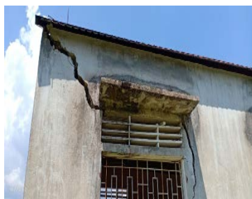
The village meeting house is damaged, cracked and unusable.