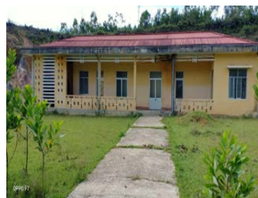
The medical office has not been put into use