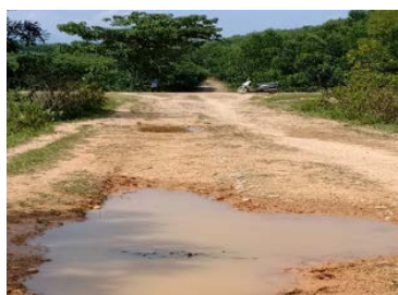
Damaged and degraded roads.