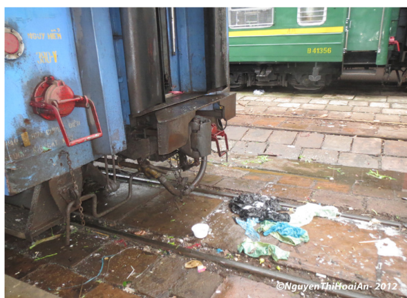
Figure 3. Waste from train at Hanoi main station

Human waste inside stations is collected by pipes into sewerage system of urban for treatment or disposal of. The research on the environmental management in rail (TRICC_JSC, 2009) was summarized, that volume of generating living solid wastes at whole passenger stations in Vietnam is about 18.9 tons/day. Forecast to 2015 it will be 23 tons/day, among which about 8.5 tons to 13 tons are organic solid wastes. Therefore, the whole volume of organic wastes from passenger trains and terminals in Vietnam exceeds 30,000 tons per year.