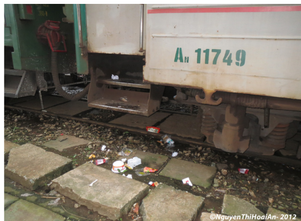
Figure 1. Waste from train beside the railroad

cal example for this problem is illustrated in Figure 1.