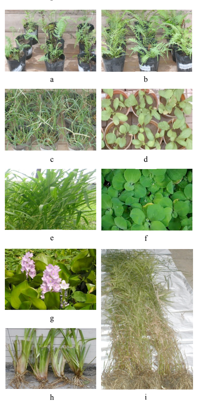
Figure 1. Plant species used in our experiments (a) Pityrogramma calomelanos; (b) Pteris vittata; (c) Eleusine indica; (d) Brassica juncea; (e) Pennisetum purpureum; (f) Pistia stratiotes; (g) Eichhornia crassipes; (h) Vetiveria zizanioide; (i) Phragmites australis.