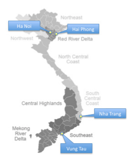
Figure 1. Locations of the workshops in Vietnam and the case studies in Germany

Three regions from Vietnam have been chosen to accommodate the workshop activities: Red River Delta region (with two workshops in Ha Noi and Hai Phong, respectively), South Central Coast region (Nha Trang city) and Southeast region (Vung Tau city), with one workshop each (Figure 1).