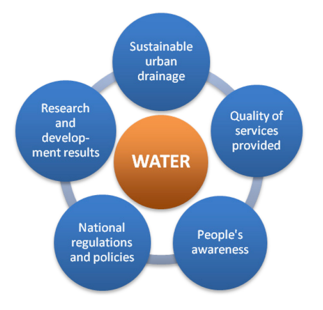
Figure 2. Criteria for the selection of workshop's sessions

Special focus has been allocated to the quality of services provided to the consumer in direct relation to implementation of technical and financial solutions for increasing the efficiency of water management in urban areas. The lectures presented covered thus various subjects that can be wrapped-up in three major sessions: safe drinking water supply, efficient urban drainage and sustainable resources conservation. The following chapters will provide a summary of the workshop lectures including a synopsis of general discussions initiated during the four training events in Ha Noi, Hai Phong, Nha Trang and Vung Tau.