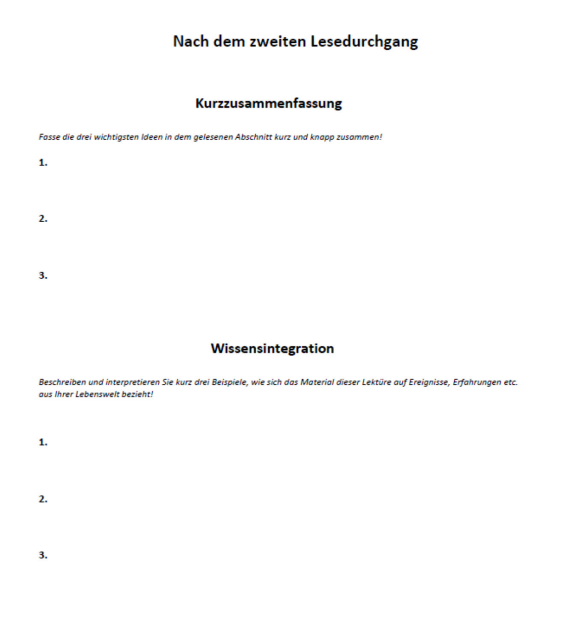
Fig. 4: Third page of the reading log for the course "Solid State Physics".

By asking the question "What new interpretations and insights of the essential physics concepts you listed at the beginning have emerged after rereading? Discuss this briefly!" the learning process itself can be reflected upon (Fig. 5). This aspect is especially important for prospective teachers.