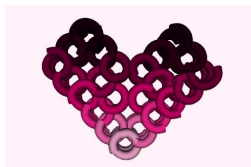
Figure 1 3D model of a heart-shaped 3D mesh

The resulting artifacts were closely oriented to the minimum of the task, were very similar to each other and the functions used were almost exclusively limited to those that had been explicitly demonstrated during the course. The