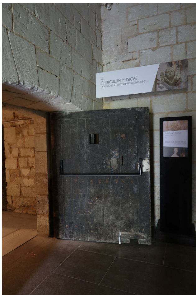
Figure 4. Cubiculum Fontevraud: entrance

Currently, we are working on a new Cubiculum dedicated to Leonardo da Vinci and the musical instruments he invented, as the Région Centre-Val de Loire will be celebrating the 500-year anniversary of his death (which occurred in 1519 at his home in Amboise) this year ( https://cubiculum-musicae.univ-tours.fr/presentation/ ). From September 2019, the Musée des Beaux -Arts at Tours