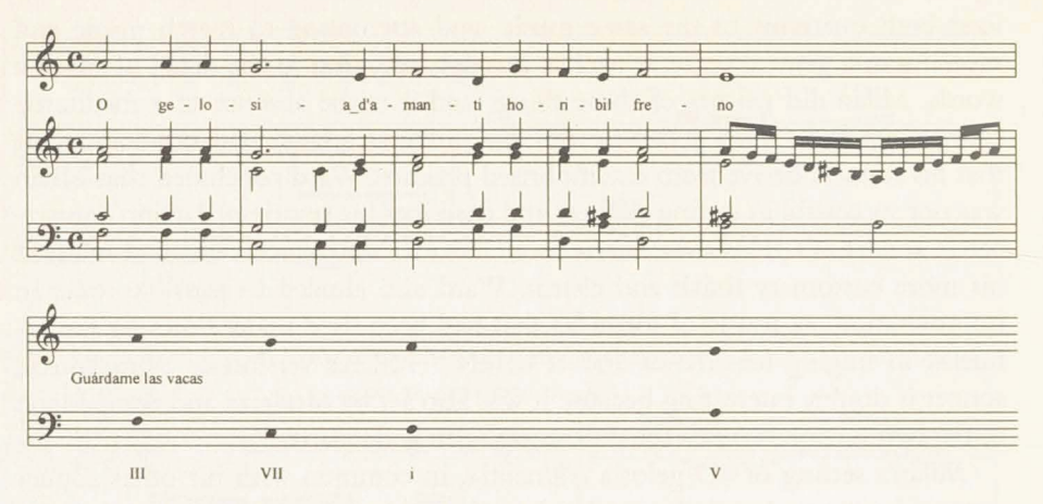
Example 5: Luis Milán, »O gelosia d'amanti«, opening