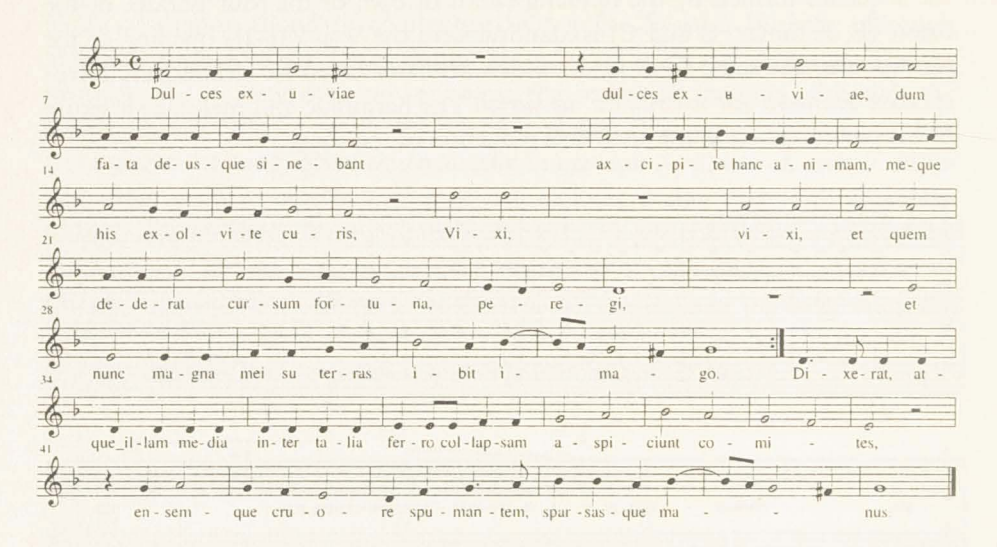
Example 10: Alonso Mudarra, »Dulces exuviae«, melody

final strophe of the piece (example 9), but others occur in bars 6–8, 19–23, and 27–29.