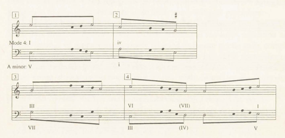
Example 8: Alonso Mudarra, »Triste estaba el Rey David«, reduction

»Triste estaba el Rey David« is a Biblical romance that laments King David's sorrow on learning of the death of Absalom. The opening of the song (see example 7), especially, is reminiscent of ecclesiastical recitation formulae and the kinds of singing found in contemporary popular Spanish laments, although historical origins of the latter cannot be assumed with any certainty. The remainder of the song does not continue the recitation formula, although the song's closing cadence recalls the opening phrase. The simple melodic outline throughout the song, given schematically in example 8, shows an archaic structure more easily associable with medieval melodic design than with sixteenth-century norms, based on phrases that ascend and descend between clearly defined points. The opening phrase on e clearly defines the Phrygian character of the piece, and the development of the melody responds to mode 4, using the lower modal tetrachord almost exclusively throughout the song. The use of e, e, and e as melodic resting points is also characteristic of this mode.