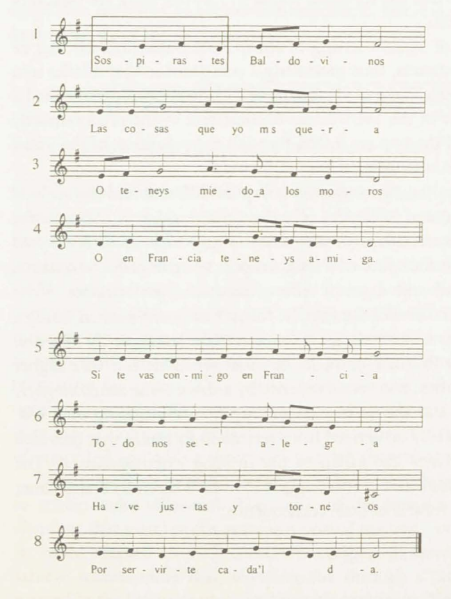
Example 1: Luis Milán, »Sospirastes Baldovinos«, melody

songs are built on formulaic patterns while others are constructed from short phrases with internal melodic repetitions that do not correspond with poetic structures. Possibly as a consequence, many of the melodies are bland and unmemorable, with little melodic interest and no discernible attempt to craft lines that have any affective relationship to their texts. This characteristic may well be interpreted as a sign of his greater concern with the manner of performance rather than musical content, a style in which delivery and the performer's art overshadows the musical substance.