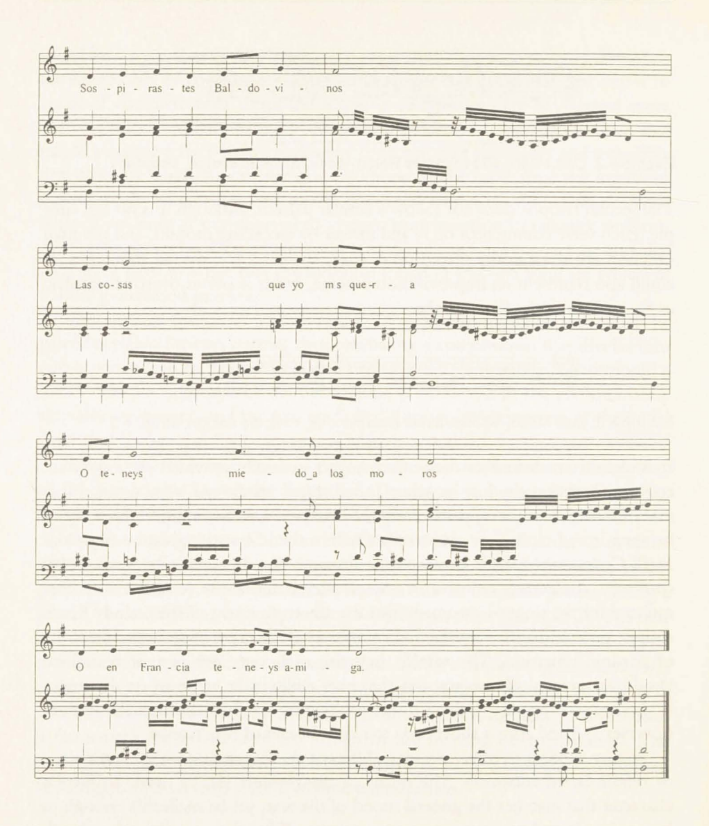
Example 4: Luis Milán, »Sospirastes Baldovinos«, strophe 1

without repetition of any kind, furnishing each line of poetry with individually crafted music to complement textual meaning. Among vihuelists, Milán and Mudarra are the only ones to have set the sonnet to music, but in notably different ways. Mudarra composed according to the poetic form, usually setting at