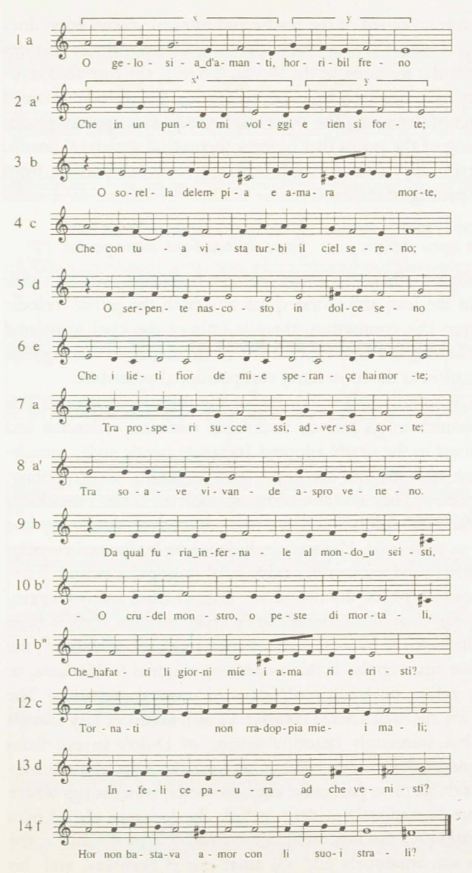
Example 6: Luis Milán, »O gelosia d'amanti«, melody

conceived for a different text genre, and probably with a different number of phrases. In support of this possibility are the several points in the setting where