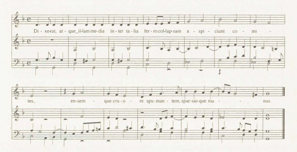
Example 9: Alonso Mudarra, »Dulces exuviae«, bars 33-46

in A-minor, these same chords are V, i, VII, and III, the harmonic vocabulary of both »Guárdame las vacas«, the pavana-folia and many other pieces. In fact, the sequence formed by the opening chord of each of the four phrases of the music (E, A minor, G and C) is identical with the V-i-VII-III opening of the pavana-folia, the same formula on which Mudarra based his deliberately retrospective Fantasía que contrahaze la harpa. The harmonic and melodic structure of the piece is given in the analytical reduction of the song.